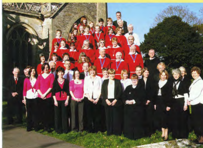
The Choirs of Yatton Moor