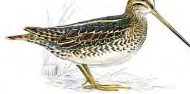
Snipe ( gallinago gallinago )