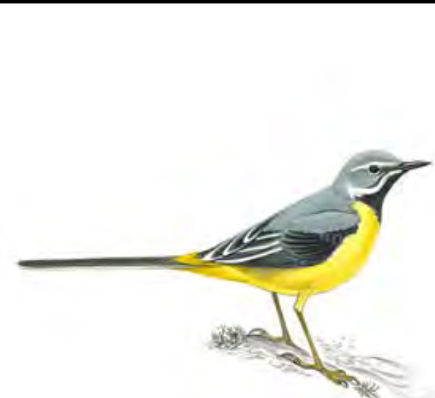
Grey Wagtail ( motacilla cinerea )